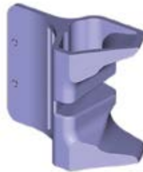
Build small lots of parts, even one-off parts, without concern for setup and changeover.