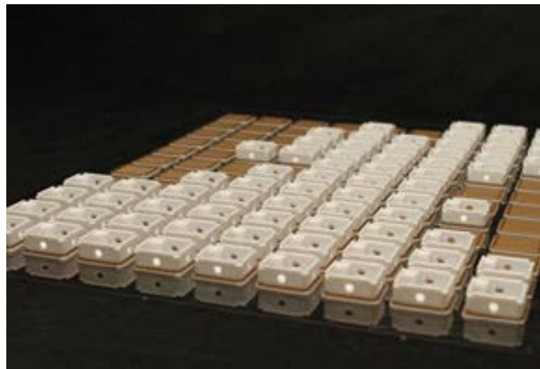
Optimize the orientation and pack of a build for maximum throughput, like these polycarbonate parts.

FDM, or fused deposition modeling, is a type of 3D printing where lines of molten thermoplastic are extruded from 3D printers. These materials then solidify exactly as they are deposited. Manufacturers are embracing FDM as an alternative to traditional manufacturing technologies, such as injection molding and machining for low-volume and customized parts.