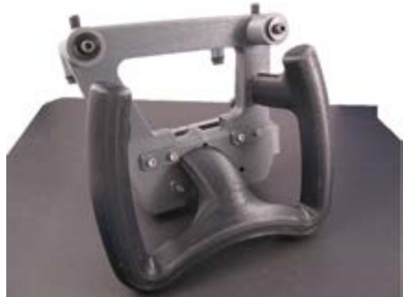
This redesigned FDM tool consolidates most components.

FDM technology avoids these problems. With FDM