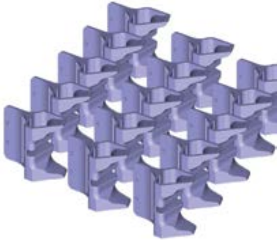
Maximize throughput with multi-part builds.

Developing strategic applications requires innovation. This occurs when organizations have experience gained by applying technology to basic usage. Ultimately, with 3D printing, this can lead to product, operations process and business model innovations that create breakthrough opportunities for experienced, insightful organizations.