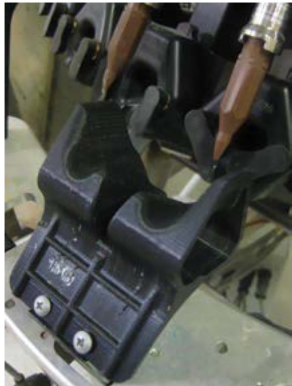
Numerous variations of this FDM part are needed by NTE's customers for use in their daily operations.