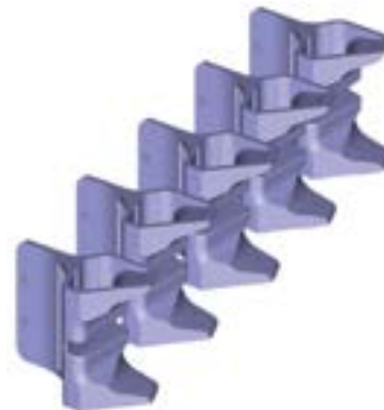
Combine multiple parts, in any combination, for building.